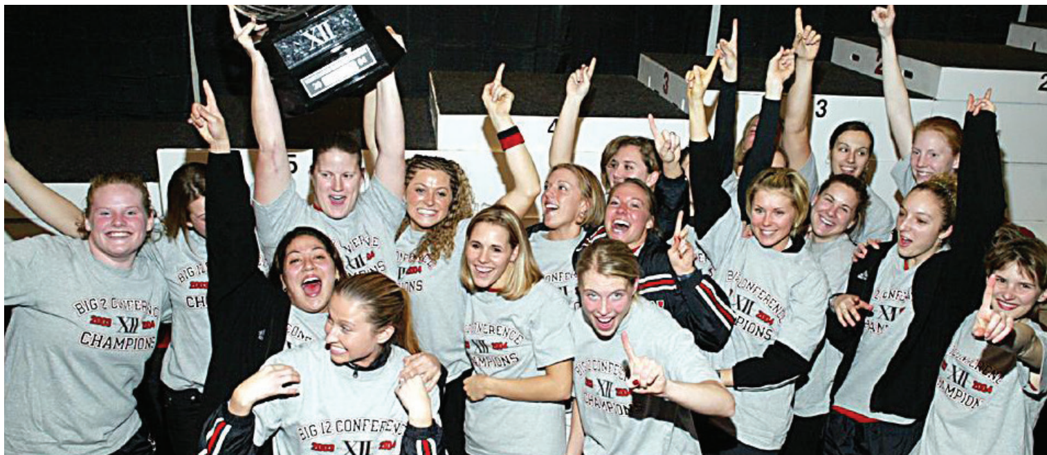
The 2004 Nebraska women won the team's 21st of 24 indoor conference titles, and went on to post third-place finishes at the NCAA Indoor and Outdoor Championships.